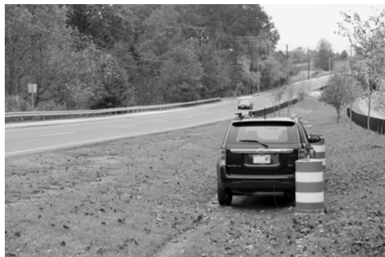
Figure 1. View of study site and research vehicle looking north toward approaching traffic

All experimental sessions were conducted between 11:30 AM and 2:00 PM so that the angle of the sun would be high and consistent between participants. All sessions were conducted in clear weather with the exception of one, which was conducted partially in light rain.